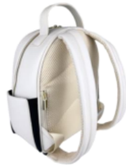
Cooling, Soft Mesh Backing with Hidden Storage Pocket