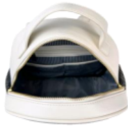
Large Internal Storage Pockets