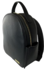
RFID Lining for added Cyber Security