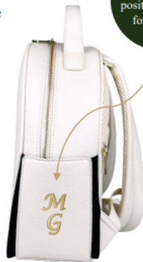
Additional personalization position, perfect for Initials!